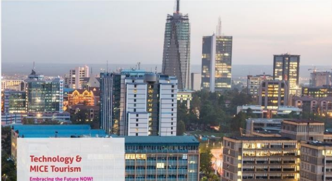
Technology & MICE Tourism Embracing the Future NOW!