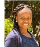
WRITTEN BY KEZY MUKIRI CEO, Zuri Events

In common with tourism in general, MICE happens not in countries but in places – largely in cities – and it is at this spatial scale that we must make relevant policies to attract MICE business, and thereby contribute to the local economy.