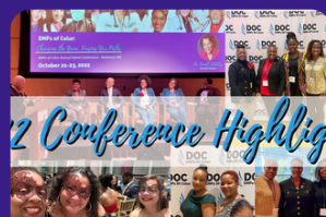
Forging New Paths /brid Conference - Baltimore, MD y, 2022