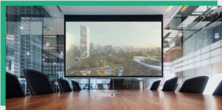
Business Briefing with Clark Stakeholders