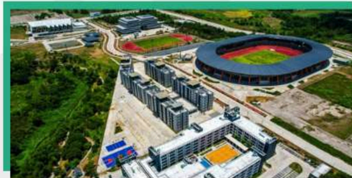
New Clark City