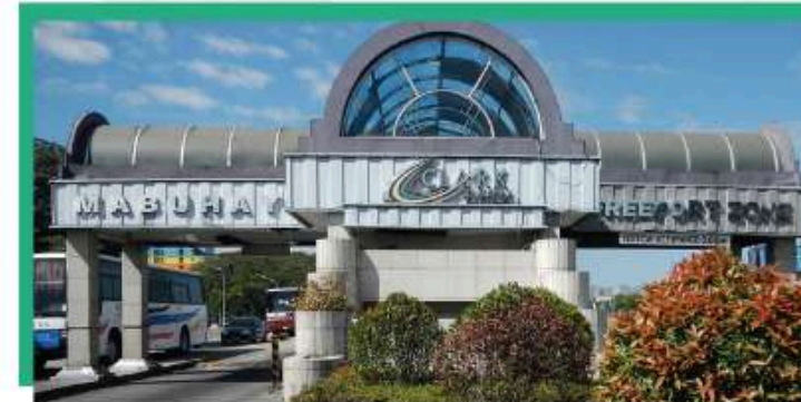
Clark Freeport Zone