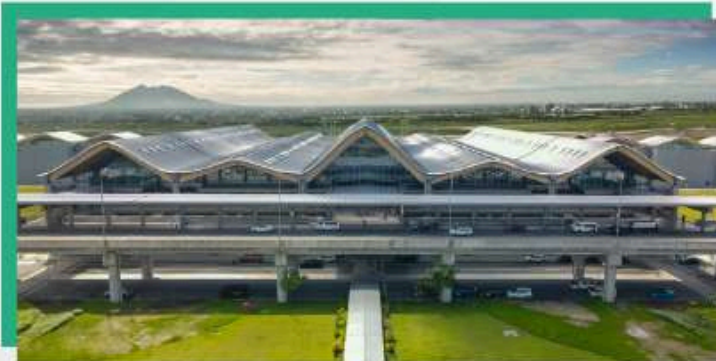
Clark International Airport