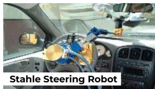
Stahle Steering Robot