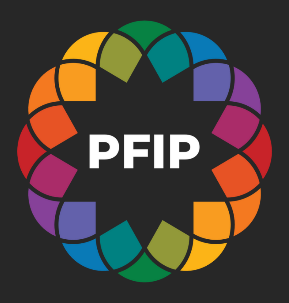
2024 Philippine Financial & Inter-Industry Pride