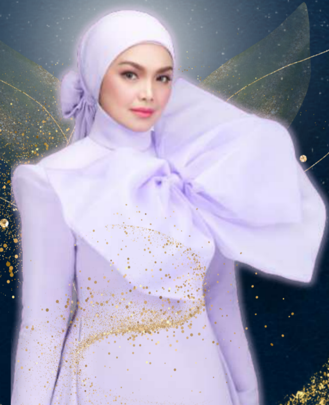
Dato' Sri Siti Nurhaliza