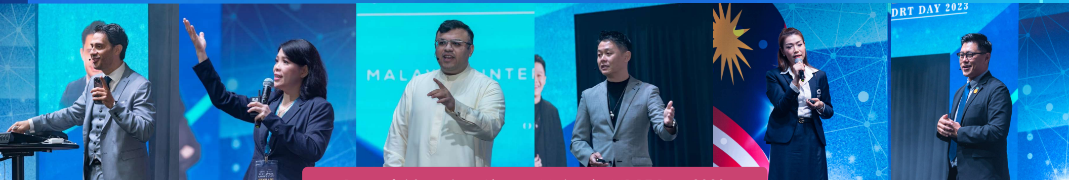
Powerful Speakers Lineup Malaysia MDRT Day 2023

This convention will feature top class performers from the industry who are Million Dollar Round Table (MDRT), Court of the Table (COT) and Top of the Table (TOT) active members. They will share sales techniques and ideas, technical information as well as motivation concepts to the life insurance agents and financial services practitioners in Malaysia. Participants will leave this convention feeling inspired and equipped to take action.