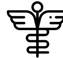
Health, Food and Pharma