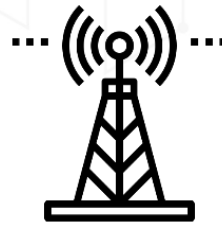
Telecoms & Connectivity

Transformation Hub First Semester: Energy & Mining Second Semester: Agriculture & Water