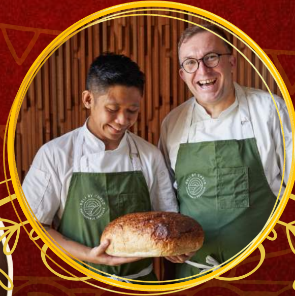
Gallery by Chele