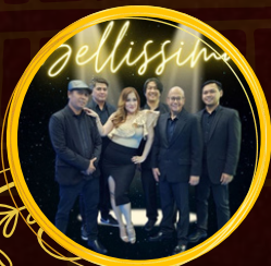
Sabor Latino y Bellissima