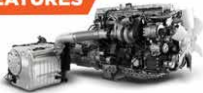
Lightest 13L powertrain in North America built to Traton Global Quality Standards