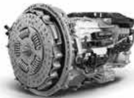
14 Speed transmission optimized for Direct Drive (13th)