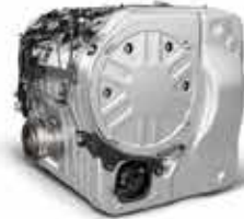
Dual Stage Aftertreatment that is designed to maximize SCR performance utilizing two doses of DEF