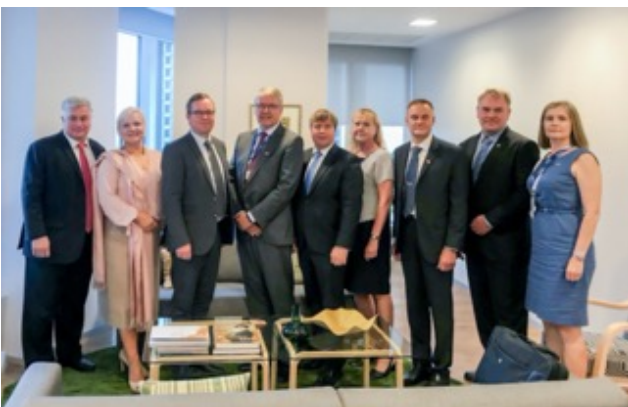
Minister of Economic Affairs Mr. Mika Lintilä visited Bangkok in August 2018.

TFCC conducted a member survey in spring 2019. Most members expressed their satisfaction towards TFCC’s services. Additionally, 90% of the respondents felt, that TFCC’s operations had met their expectations.