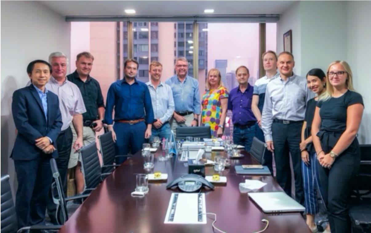
The Board of Directors and the Staff Members of TFCC, from left to right: