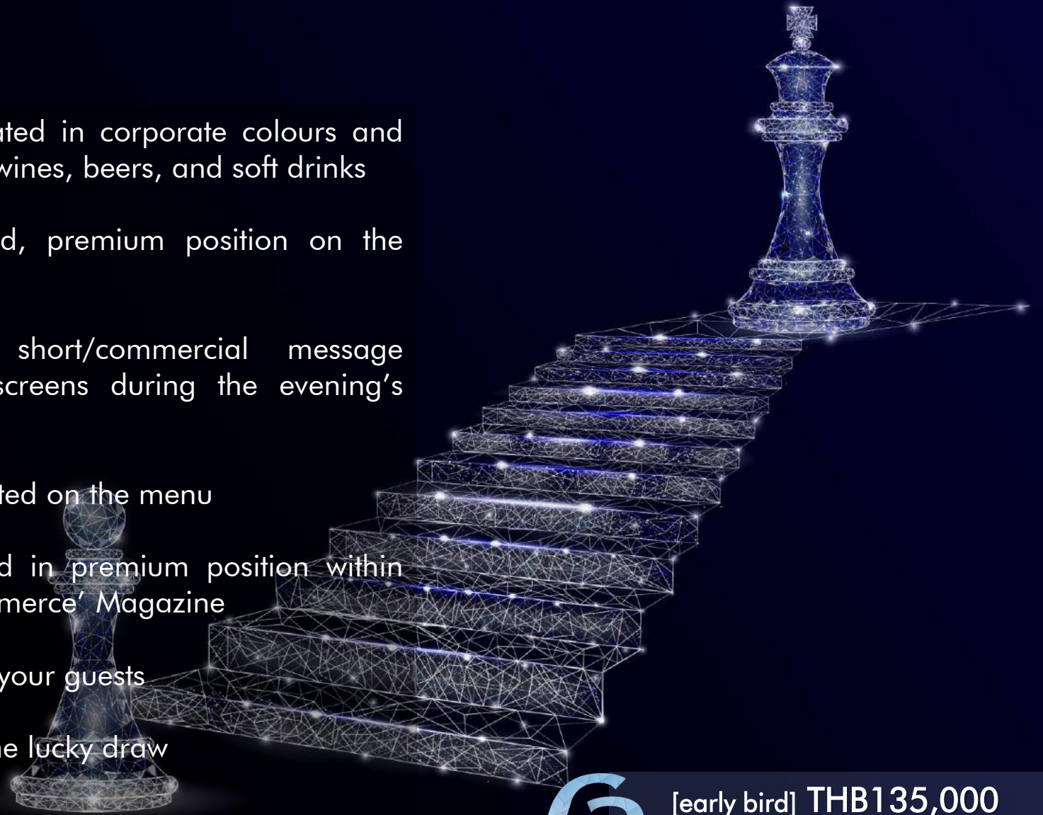
Table to be placed within proximity to stage and VIP table