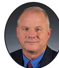
Senator Jim Hendren President Pro Tempore Arkansas State Senate