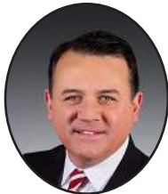
Senator Lance Eads Member Arkansas Senate