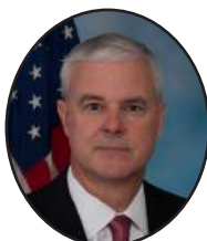
The Honorable Steve Womack Member United States House of Representatives