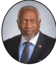
Mayor George McGill Mayor City of Fort Smith