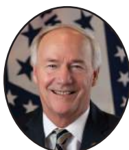
The Honorable Asa Hutchinson Governor State of Arkansas