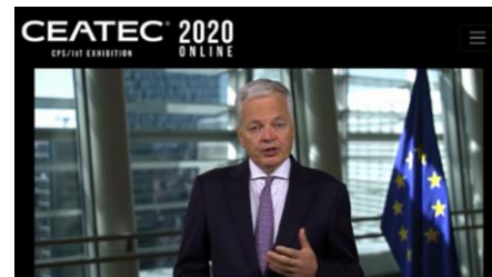
Commissioner Didier Reynders, the European Commission