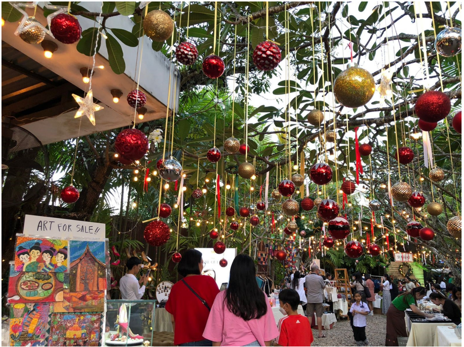
Various products sold at the event