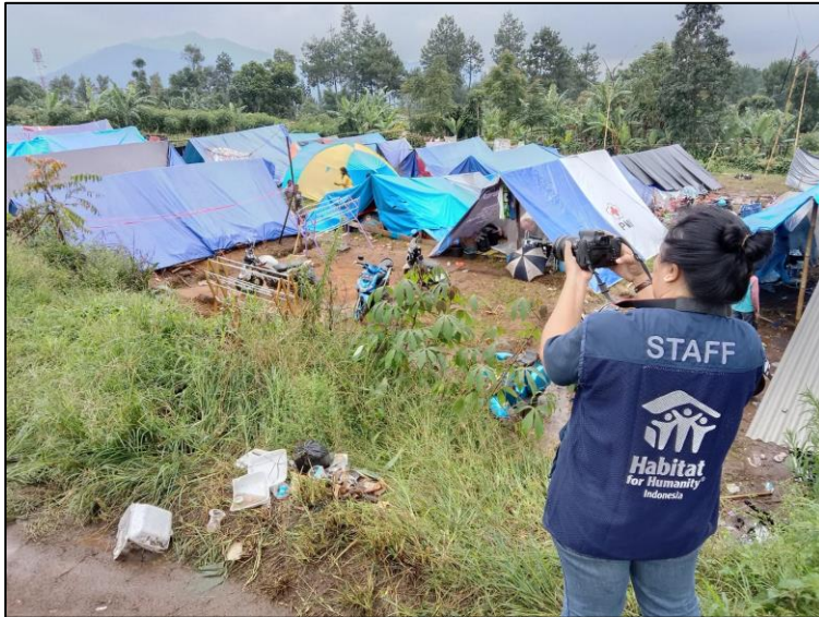
Assessment In Tent area