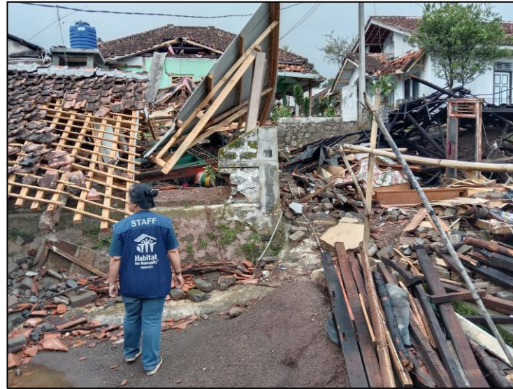
Observation damaged building