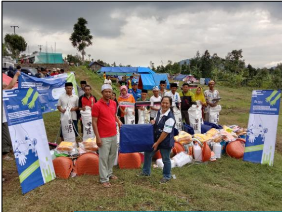
Distribution of ESK and WCK- First Batch

As of 25 th November 2022 , up to 199 packages of ESK and WCK have already arrived in Cianjur and stored in the joint emergency warehouse of Habitat Indonesia with Human Initiative. The 199 ESK and WCK are part of the relief prepositioning items delivered from two Habitat Indonesia warehouses location in Jakarta and Yogyakarta.