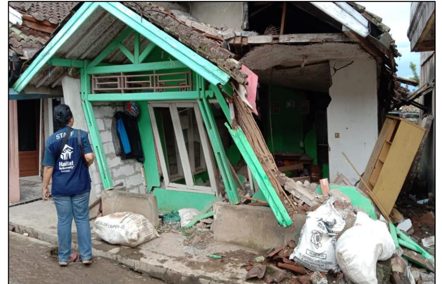
Observation damaged building